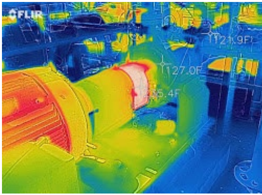
Thermal imaging revealed that the bearing housing was running extremely hot, making failure imminent.

ITT Solutions Engineering took further vibration, flow and pressure measurements and quickly concluded that this was a straight-forward operational issue: the pumps were running way back on their curves. Knowing that low flow situations were a possibility, the company had installed recirculation lines, but they were inadequate because they weren't sized appropriately. In actuality the pumps were about four times larger than they needed to be for this application. And that was the root cause for the repeated bearing and seal failures via excessive thrust loads.